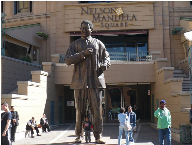
The statue of Nelson Mandela at the Sandton Mall.

A fundamental mission of the International Gifted Education Teacher-Development Network (Iget-Network) is to bring gifted education best practices, particularly those relevant to the identification and nurturance of culturally diverse learners, to developing countries where gifted education is not included within education policies. We believe that to achieve this end it is necessary to: