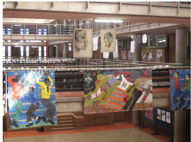
The University of the Witwatersrand's School of Education Boyce Block Artistry