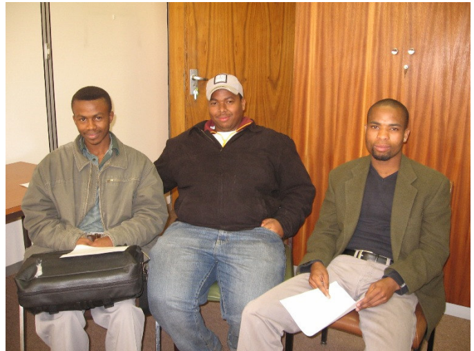
University of the Witwatersrand's Teacher Education Students who took the course on Educating Culturally Diverse Gifted Learners in 2007